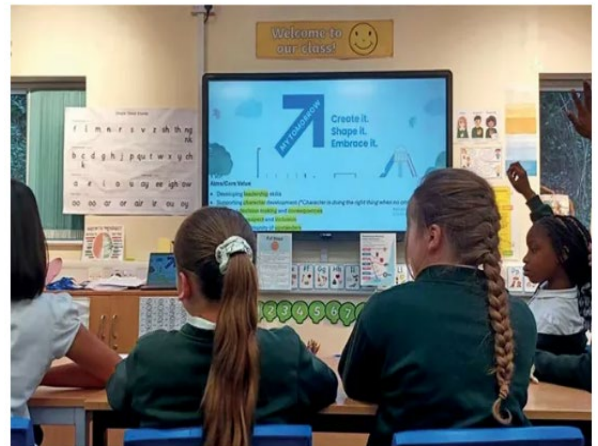
Change Makers is teaching young people how to be an ‘upstander’, so they can look out for their younger peers

Children are trained to challenge bad behaviour in school, support peers who have been victims of bullying and talk to perpetrators to recognise the impact it has.