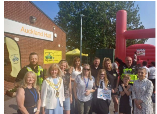
Solihull Observer – June 2025